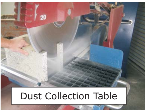
Dust Collection Table

Jack Vac Dust Collection Table Price $2351.00 Fits Most Conventional 20" Masonry Saws Dry Cutting Of Brick and Concrete Products Patented Design to work with JV 2000 Vacuum