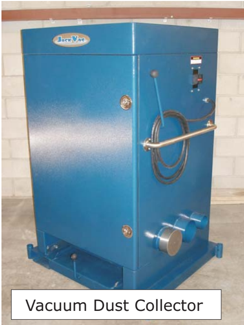
Vacuum Dust Collector